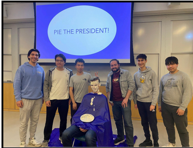
PowerPoint Party winners at Fourth General!