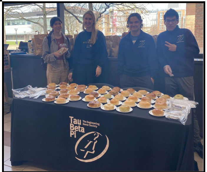
The Breakfast Parties!