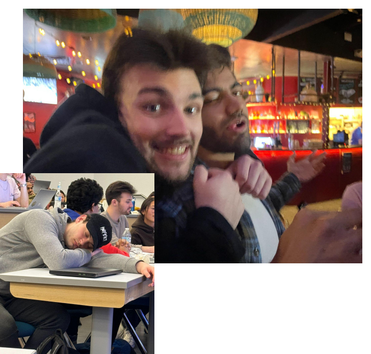
top tier bromance