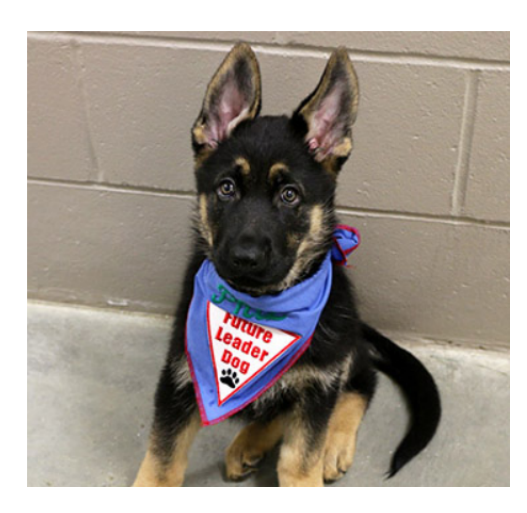
400 Puppy Raisers