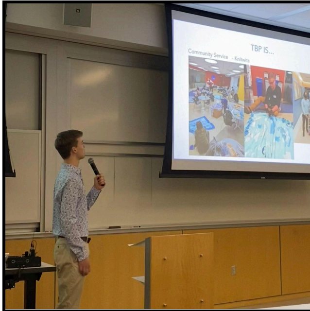
First General Meeting!