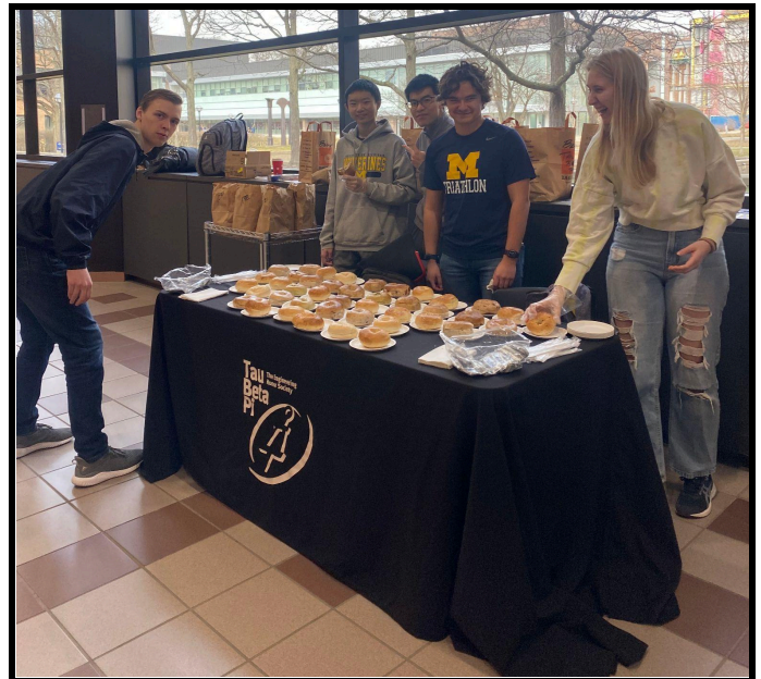
The Breakfast Parties!