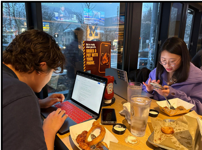
Buffalo Wild Wings Social!