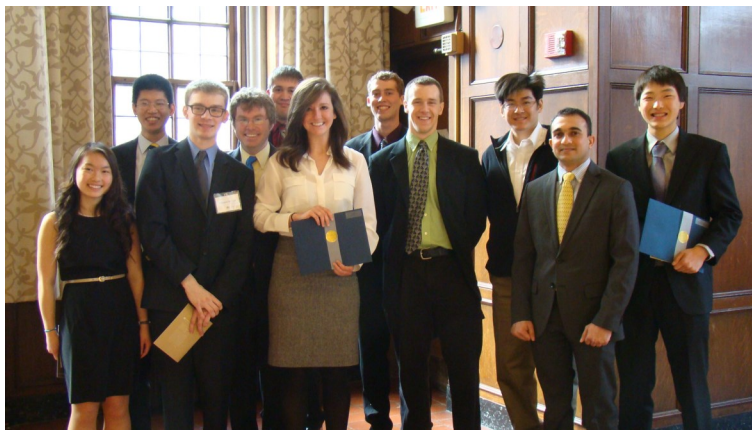
Above: TBP members pose with the Elaine Harden Award.

In addition to honoring individual students, the Honors Brunch is an opportunity to recognize outstanding student organizations. This year, Tau Beta Pi was awarded one of the two Elaine Harden Award (the other was awarded to the Society of Women Engineers). It was fantastic for Tau Beta Pi to be recognized as an outstanding student organization within the College of Engineering. It was also a truly rewarding experience for Tau Beta Pi to be a part of coordinating the Honors Brunch to recognize individual students who do so many great things within the College of Engineering community.