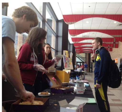
Above: TBP volunteers serve pie to students.

As part of the National Association's initiative to promote engineering on Pi Day, the MI-G chapter orchestrated two college-wide outreach projects to promote engineering and TBP on campus. In addition, electees and actives wore their TBP apparel throughout the day to expand awareness of the chapter for prospective members. Overall, the day was a great success and improved TBP's visibility on campus.