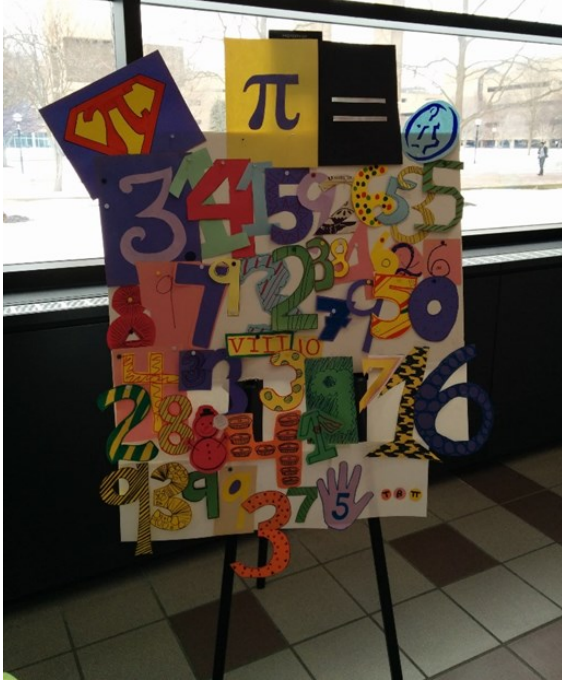
Above: The final collaborative art project displaying the 50 digits of pi.