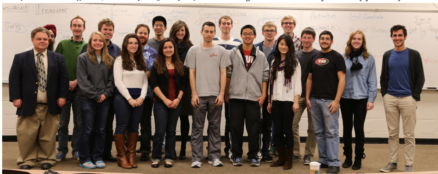
Above: Winter 2014 officers and advisors after elections.