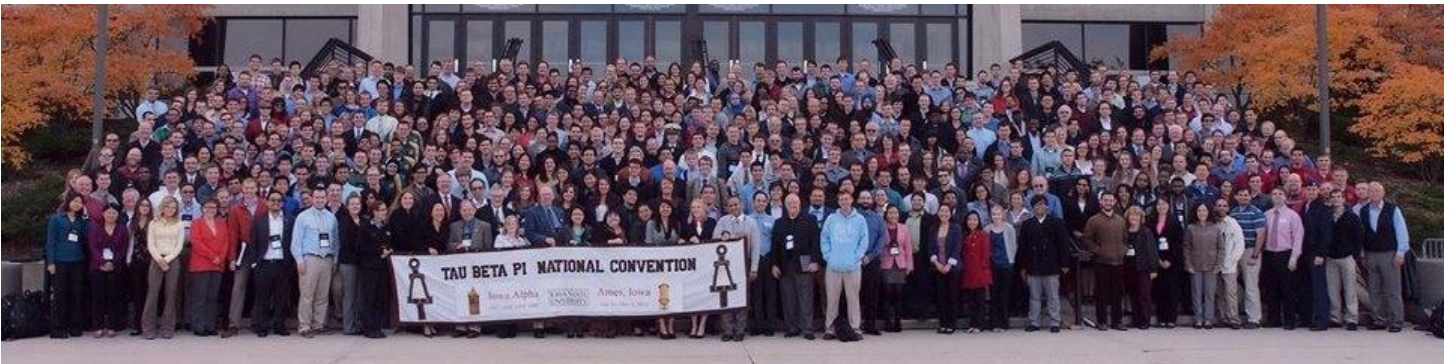
Above: All participants of National Convention gathered for a picture.

Next year’s Convention will be held in Spokane, Washington. We look forward to another wonderful Convention and hope to build on some of the positive momentum from this Convention going forward.