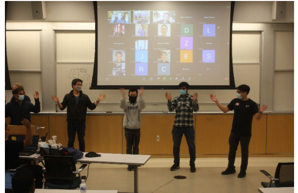
Electee Team Presentations