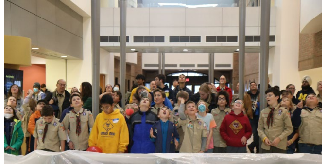
Cub Scouts Day