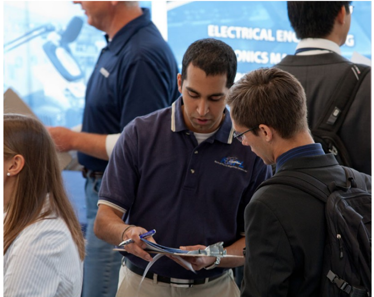
Figure 2: Recruiters stayed busy screening potential candidates

Making every company feel welcome and appreciated requires dedicated chairs that are committed to running a successful Career Fair. Because the students that run the fair are some of its principle beneficiaries in terms of job opportunities, going above and beyond is just part of the routine.