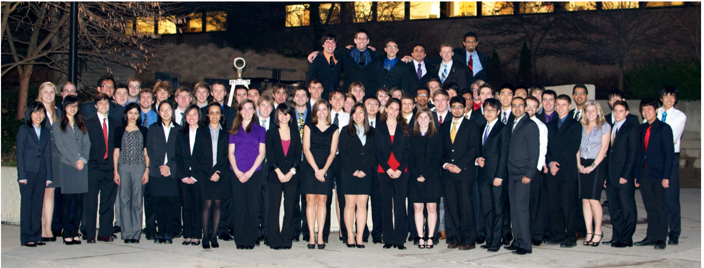
Above: The fall 2011 electee class along with several of the fall 2011 Officers.