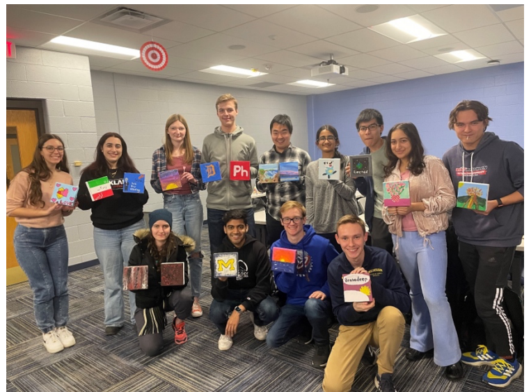
Valentine's Day Party!