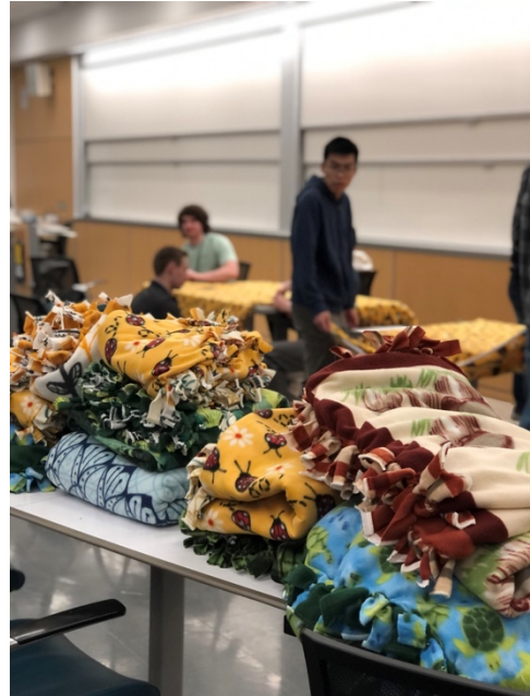
Making blankets for Knitwits