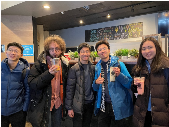
Boba Social with actives and electees!