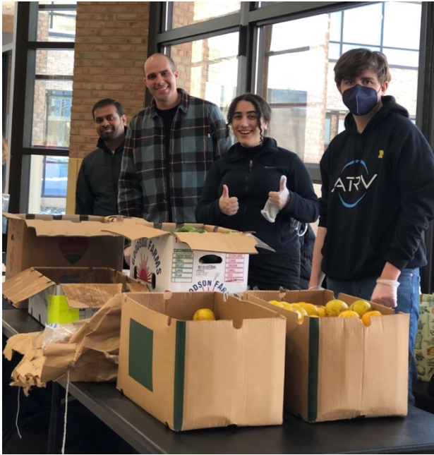
Giving out food for the Maize and Blue Cupboard