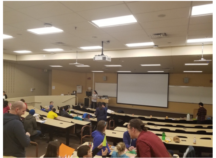
MindSET: Water Bottle Rockets Event