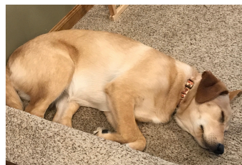
To fill space: Here's a photo of my puppy, Mel